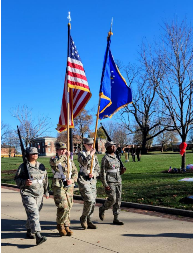
Air Force Junior ROTC Pass in Review during our Veterans Day Celebration

The mission of Fort Hayes is to create expectations of excellence within students through challenging and collaborative learning by blending the arts, academic and career programs.