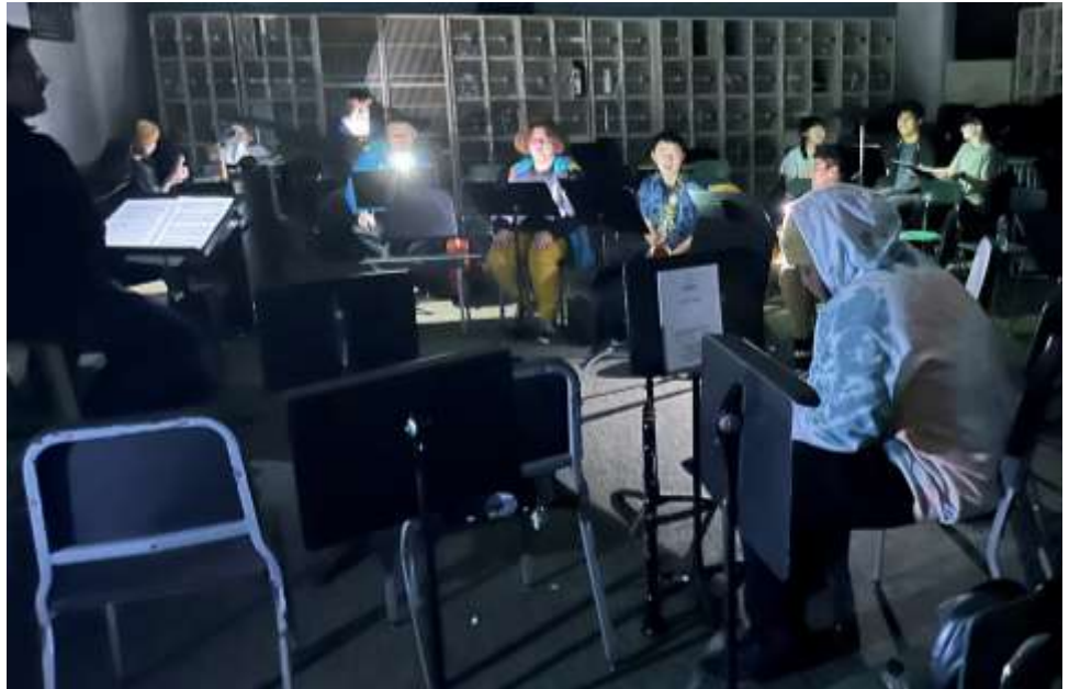
"The Show Must Go On"

Rehearsal for this year's musical continues even through an after school power outage – "This is about how much light you will have in the pit"