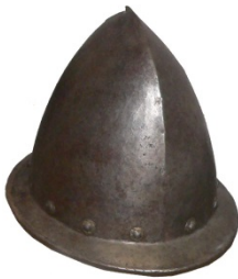
Image of a morion (the helmet of common soldiers)

The first thing he did was to clean up some armor that had belonged to his great-grandfather, and had been for ages lying forgotten in a corner eaten with rust and covered with mildew. He scoured and polished it as best he could, but he perceived one great defect in it, that it had no closed helmet, nothing but a simple morion. This deficiency, however, his ingenuity supplied, for he contrived a kind of half-helmet of pasteboard which, fitted on to the morion, looked like a whole one. It is true that, in order to see if it was strong and fit to stand a cut, he drew his sword and gave it a couple of slashes, the first of which undid in an instant what had taken him a week to do. The ease with which he had knocked it to pieces disconcerted him somewhat, and to guard against that danger he set to work again, fixing bars of iron on the inside until he was satisfied with its strength; and then, not caring to try any more experiments with it, he passed it and adopted it as a helmet of the most perfect construction.