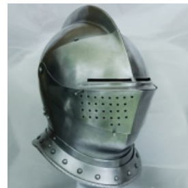
Image of a closed helmet (the helmet of knights)